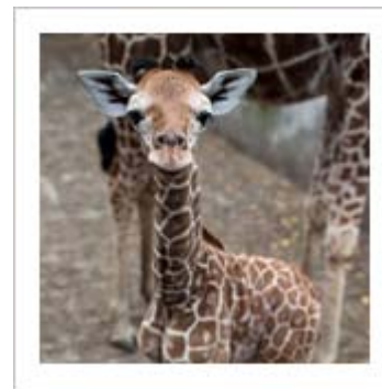
This Baby Giraffe Is Too Cute For Words

You haven't started pinning on Pinterest yet and you want to get started? If so, click here .