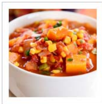
Try Yummy Tomato Butternut Squash Soup