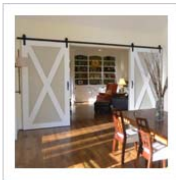
Sliding Barn Door Adds Cool Country Touch